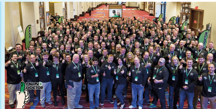
Lawn Doctor celebrated its 50th anniversary in 2017. The Holmdel, New Jersey-based company employs 1,350 people and posted $112 million in 2017 revenue, ranking 14th on the Top 100 list.

Davey's "Vision 20/20" strategic plan, which was implemented during Warnke's tenure as CEO, remains the focal point of Davey's operational strategy and has placed the company on a projected path to reach $1 billion in revenue by 2019.