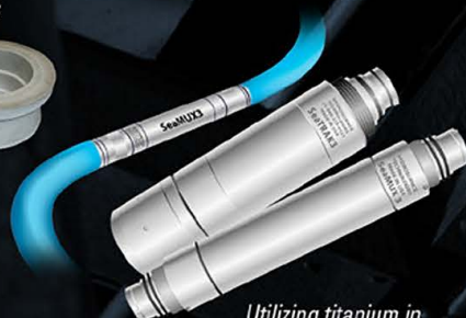
Utilizing titanium in subsea components for the geophysical seismic industry