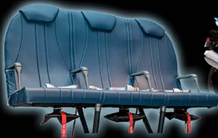
Expanse Airline Seats