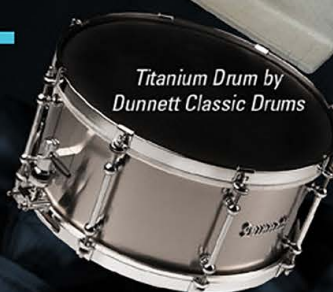
Titanium Drum by Dunnett Classic Drums