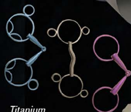
Titanium Horse Bits by Lorenzini SNC