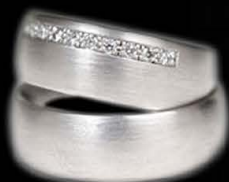
Utilization of titanium in jewelry and consumer applications