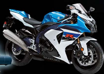
Expanding use of titanium in motorcycle and automobile industries