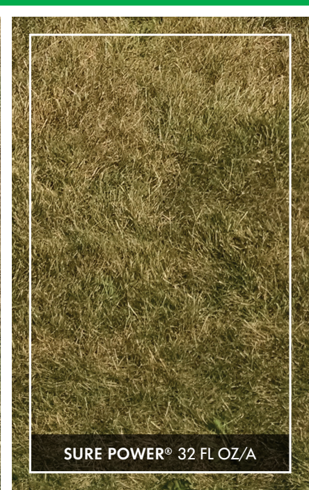
Dave Gardner, The Ohio State University, 2017 | Sure Power® 32 fl oz/A | 1 application on July 25