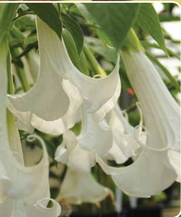
Little Angel Brugmansia

Nantucket Blue™ Hydrangea is a new repeat blooming selection of the renown hydrangeas that adorn Nantucket Island. This great new plant from Garden Debut