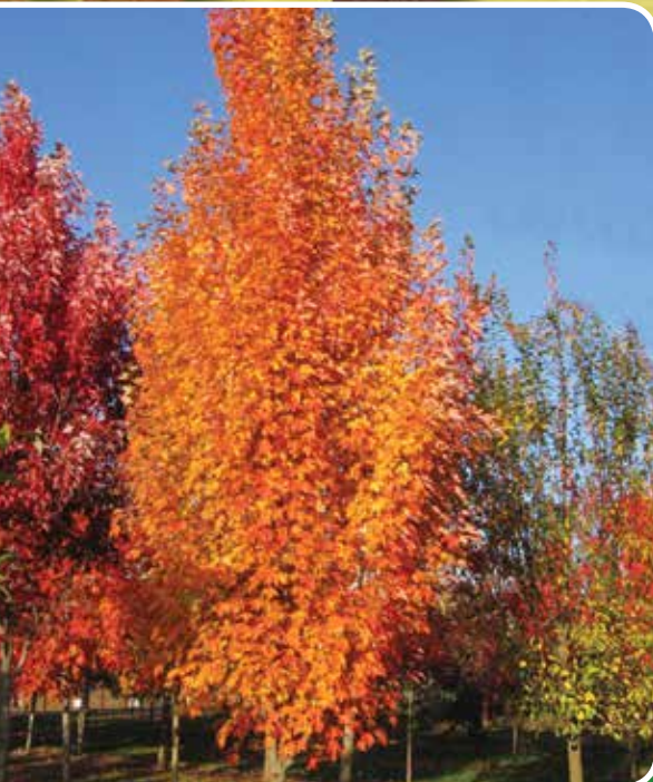
Armstrong Gold™ Maple