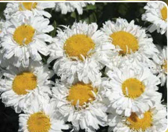
Leucanthemum x superbum 'Freak!'

and blooms from late May until frost. It's a vigorous grower with a compact, self-branching habit. Grow in full sun to part shade in average, well-drained soil. It's hardy in USDA Zones 5 to 8 and AHS Heat Zones 12 to 2. Discovered by Jeddeloh Pflanzen in Germany and introduced through Blooms of Bressingham.