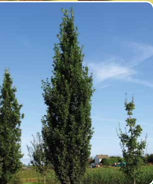
Skinny Genes™ Oak

the luxuriant deep purple flowers of Syringa 'Purple Glory' ( Syringa × hyacinthiflora ). Individual flowers the size of a juicy grape open on full racemes one to two weeks before common lilacs to provide a long lasting bloom. New leaves will emerge in spring with a purple blush and in fall these purple highlights return. Dense foliage fills branches low to the ground making Purple Glory an attractive specimen plant or useful massed in a hedge or screen. At maturity, it reaches 6- to 8-feet high and 6 feet wide. It's hardy to Zone 2. Purple Glory is deer resistant.