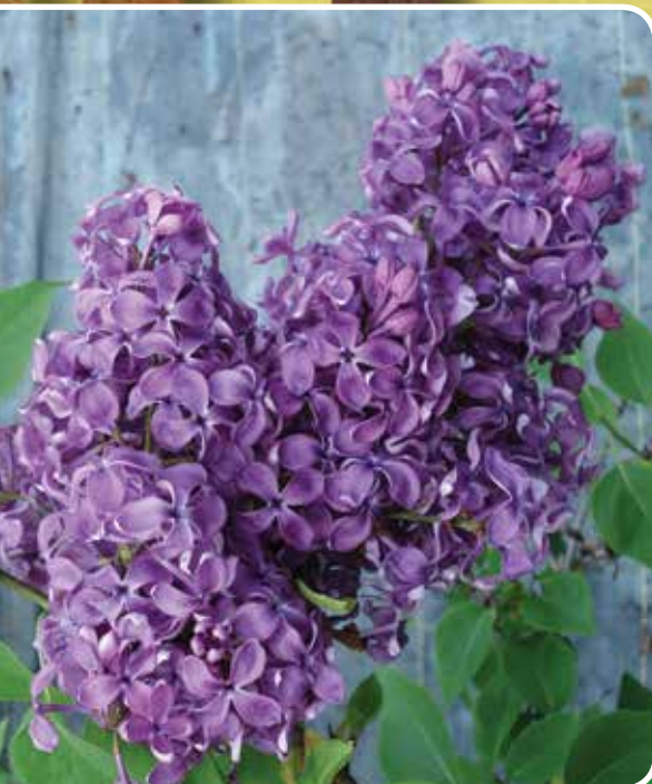
Purple Glory Lilac

A delicious fragrance permeates the air surrounding