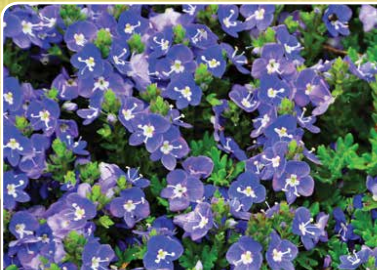
Tidal Pool Speedwell

Perfect for use in Spring-planted programs. They're