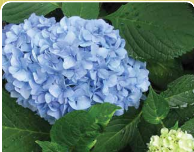
Nantucket Blue™ Hydrangea