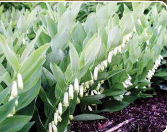
Prince Charming Solomon's Seal

was developed by Green-leaf Nursery Company for its prolific blooming and vibrant bloom color.