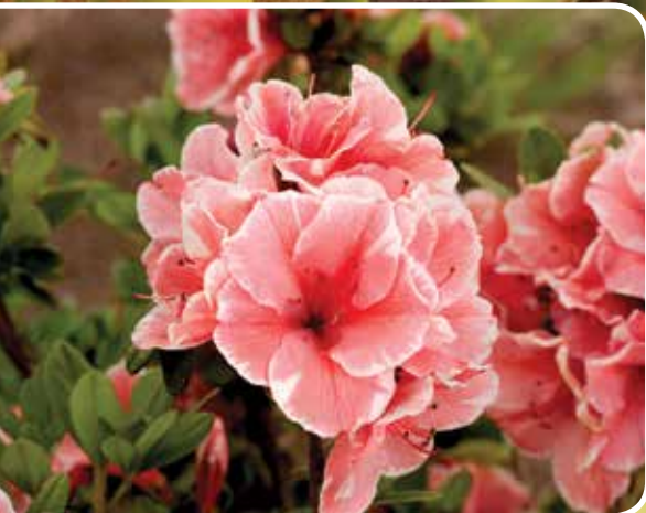
Encore® Azalea Autumn Sunburst™