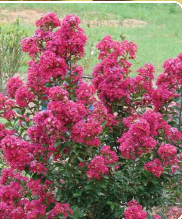
Enduring Summer™ Lagerstroemia