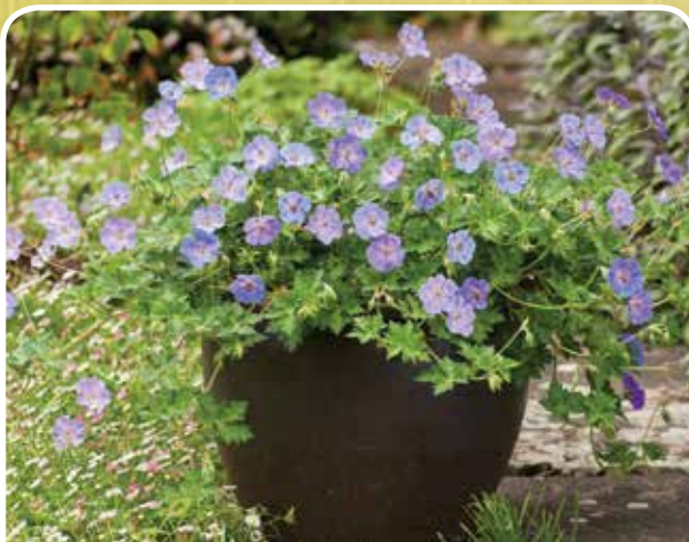
Geranium 'Azure Rush'

'Azure Rush' is a hybrid from Geranium 'Rozanne,' the 2008 PPA Perennial of the Year with the same traits, except for light blue flowers and a more mounding habit. Height is 22 inches and width is 32 inches. 'Azure Rush' loves the heat