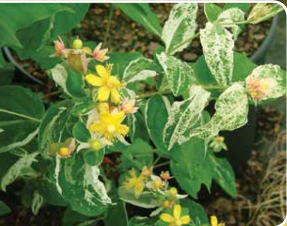
Snow Splash™ Hypericum