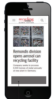
SMARTPHONE STATIC BANNER