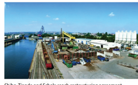
Chino-Tiande and Scholz reach restructuring agreement

News Today Global Edition Staffs receive bridge loan to access synthetic assets