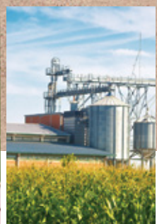
Stored Food Fumigation