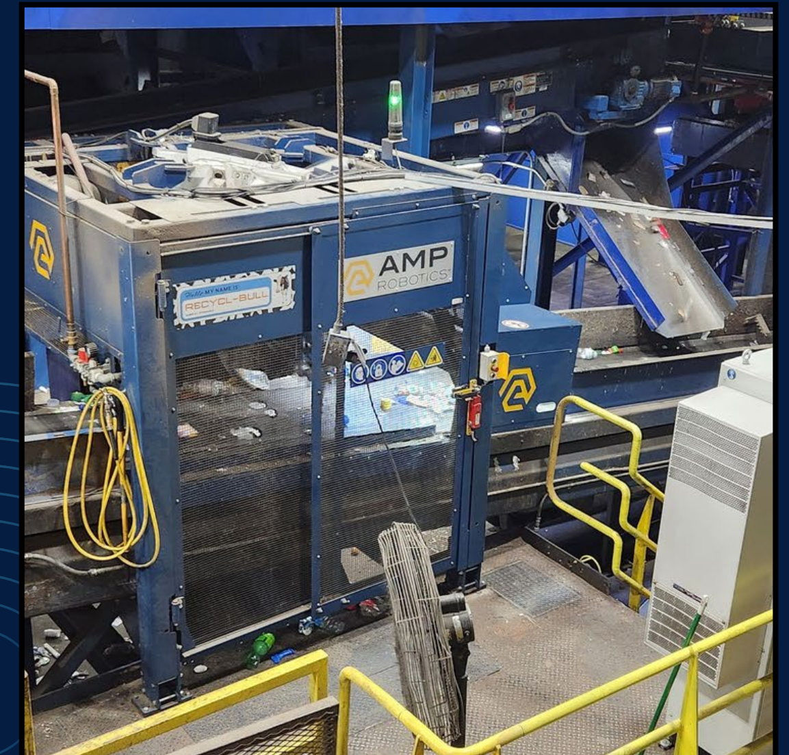
3 Amp Robotics sorting plastics & aluminum