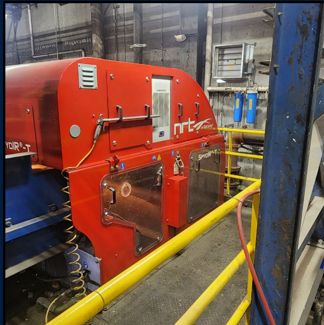
NRT Optical for Sorting PET