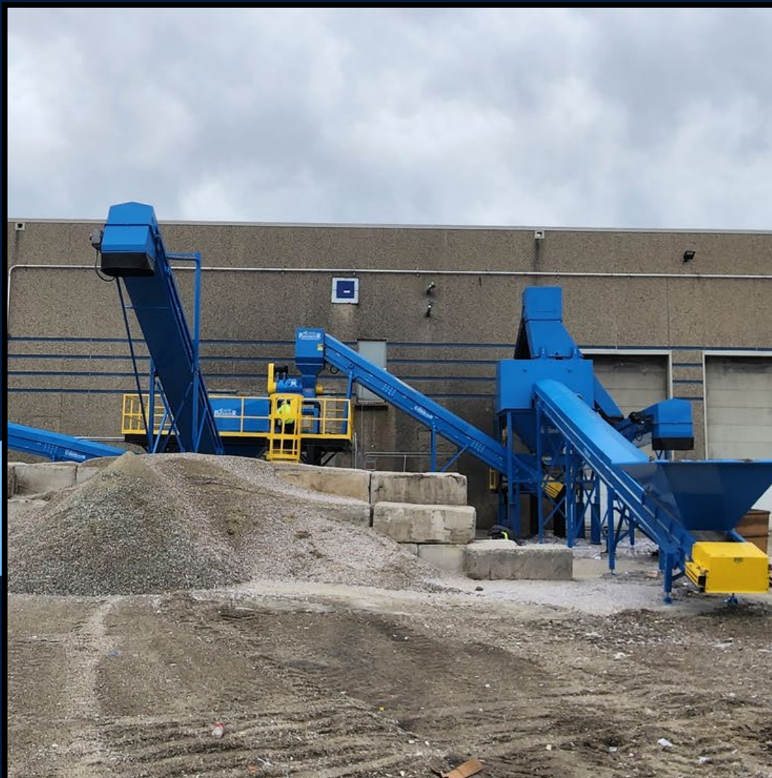
Andela Glass Clean Up System