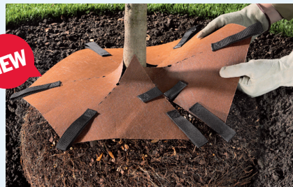
DuPont™ UnderAnchor® TREE STABILIZATION SYSTEM