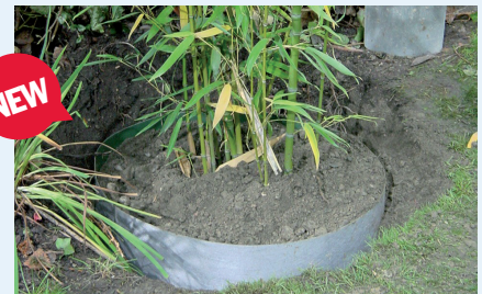
DuPont™ Root Barrier INVASIVE ROOT PROTECTION