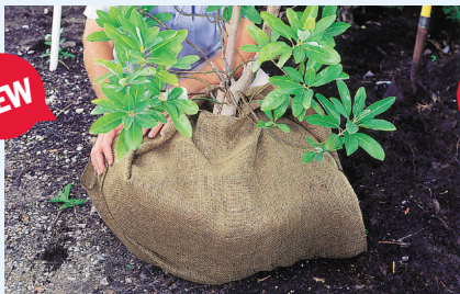
DeWitt Deluxe Natural Burlap PLANT PROTECTION PRODUCT

By continually investing in technology, new products and equipment, DeWitt is able to consistently provide the highest quality products like the new tree care and protection products from DuPont.