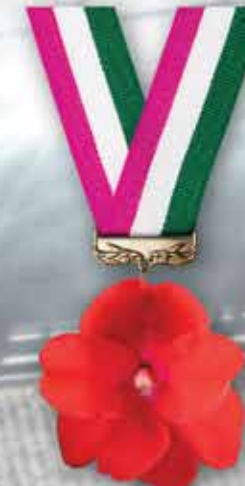
SOL LUNA PRIME™ Impatiens hybrid