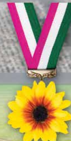
SOL SEEKER™ Helianthus