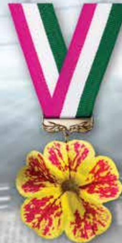
LIA™ Abstract Lemon Cherry Calibrachoa