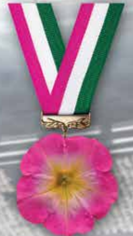
CAPELLA™ Pink Morn Petunia