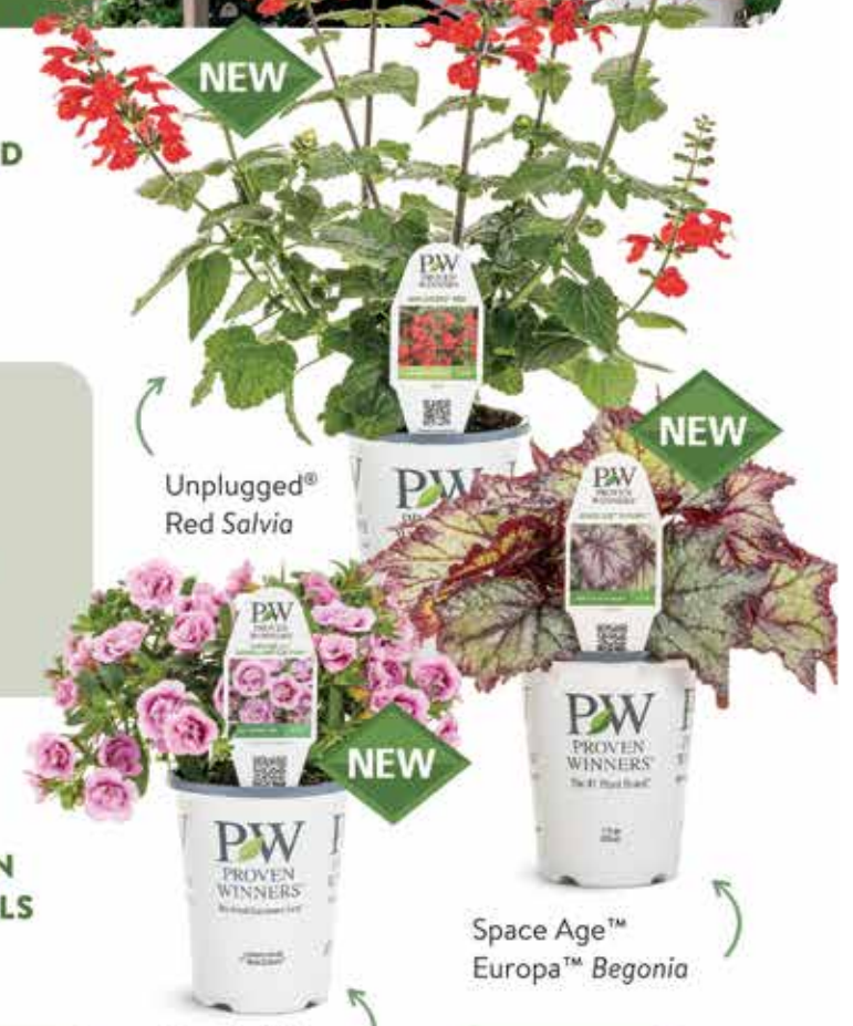
Superbells® Double Smitten Pink™ Calibrachoa

BACKED BY A MULTI-MILLION-DOLLAR NATIONAL MARKETING CAMPAIGN